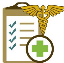
Health Compliance and Responsiveness