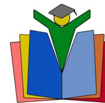
Programs for Sustainable Education