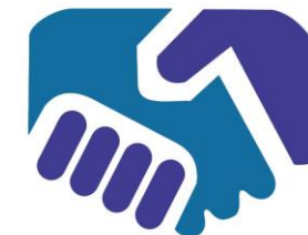
Safety, Peace and Order