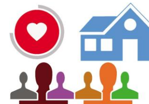
Social Protection and Sensitivity Programs